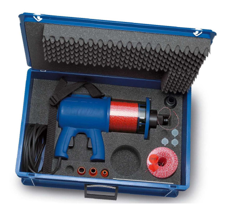
Standard equipment in strong plastic case current source 230V/10A or 115V/20A