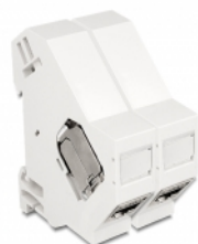
Anwendungsbeispiel mit Stecker