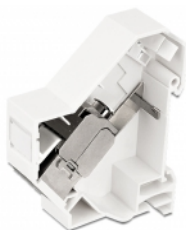
Anwendungsbeispiel mit Stecker