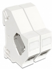
Anwendungsbeispiel mit Stecker