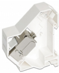
Anwendungsbeispiel mit Stecker