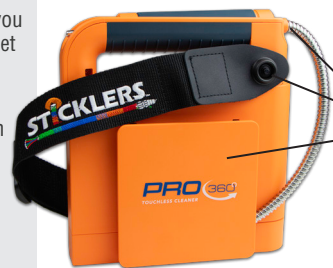
Handset orientation with Tip Protection Shoulder Strap / Release Button Handset Cord Storage Plate Cleaning Tip – 1.25mm / 2.5mm Handset Alignment with Male Patch Cord