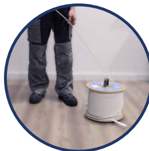
EK ROLLER COIL UNWINDING