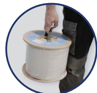
EK ROLLER REEL HANDLE