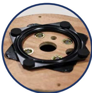
EK ROLLER MECHANISM