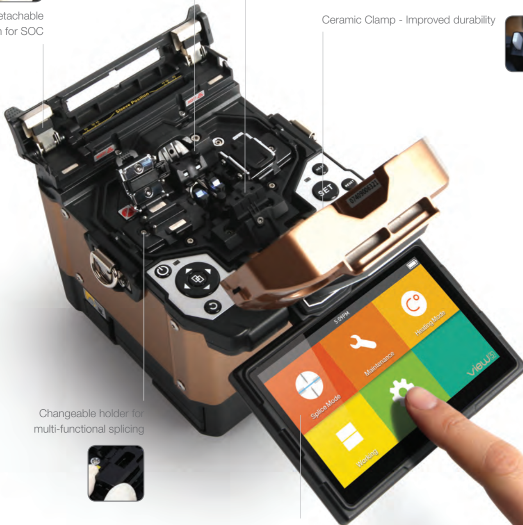
Changeable holder for multi-functional splicing