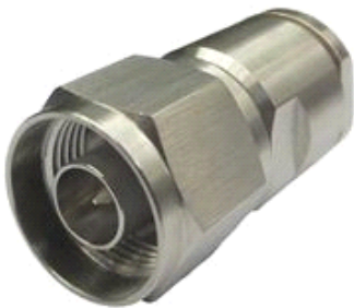
400BPNM-C Type N Male for CNT-400 braided cable