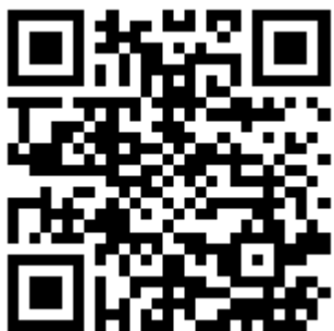
SCAN QR FOR PRODUCT PAGE